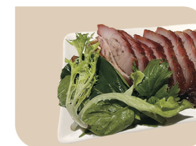
BBQ Pork 叉燒 $18.80