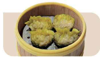
Steamed Pork & Prawn Dumplings 鮮蝦魚翅餃 $10.80