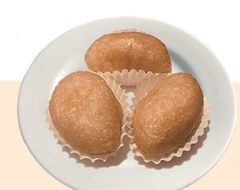
Deep Fried Glutinous Dumplings W/ Pork Mince (Football) 家鄉鹹水角 $9.80