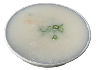
Prawn Congee 鮮蝦粥 $12.80