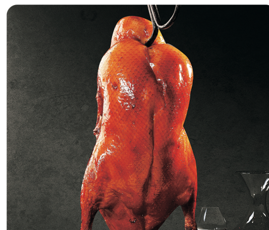
Peking Duck (2 Courses) 北京片皮鴨 (二食) $88.80

COURSE 1 PEKING DUCK PANCAKES wrapped with duck skin, cucumber, shallot and peking duck sauce