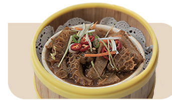
Beef Tripe W/Chu Hou Sauce 柱候金錢牛肚 $8.80