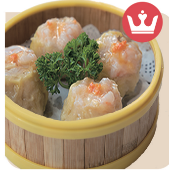
Steamed Dim Sum (Pork&Prawn) 鮮蝦燒賣皇 $10.80