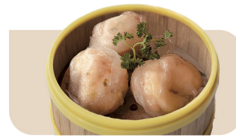
Steamed Prawn W/ Coriander Dumplings 香菜蝦粉果 $10.80