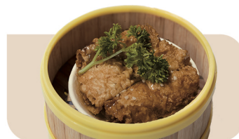
Steamed Beancurd Skin Roll W/ Oyster Sauce 蠔油鮮竹卷 $8.80