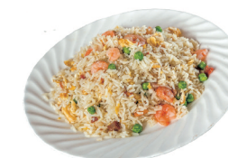
Special Fried Rice 揚州炒飯 $16.80