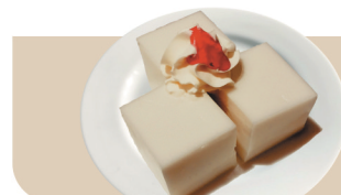
Coconut Jelly 椰汁糕 $7.80