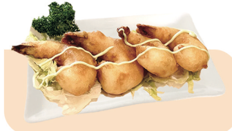
Wasabi King Prawns 芥末蝦球 $18.80