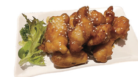
Honey Chicken 蜜糖雞球 $16.80

COURSE 2 DUCK SAN CHOY BOW with roast duck meat, onion, capsicum and lettuce leaf OR DUCK FRIED RICE / NOODLE