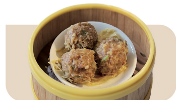
Steamed Minced Beef Balls 山竹牛肉球 $8.80