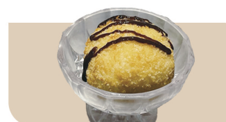
Deep Fried Ice Cream 炸雪糕 $8.80