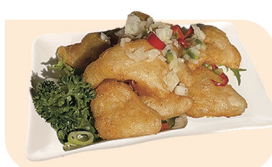
Salt & Pepper Calamari 椒鹽魷魚 $17.80