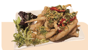
Salt & Pepper Squid Tentacles 椒鹽魷魚鬚 $17.80