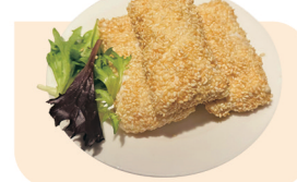
Sesame Prawn Rolls 鮮蝦芝麻卷 $15.80