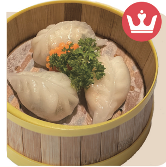
Steamed Prawn W/ Chives & Dumplings 鮮蝦韭菜餃 $10.80