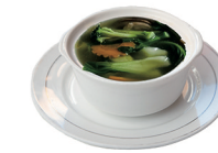
Vegetable Soup 素菜湯 $9.80