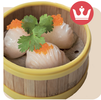
Steamed Prawn Dumplings 唐宴蝦餃皇 $10.80