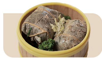
Steamed Sticky Rice & Meat in Lotus Leaf 珍珠糯米雞 $9.80