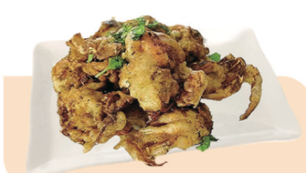
Salt & Pepper Soft Shell Crab 椒鹽軟殼蟹 $17.80