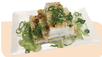
Pan Fried Radish Cake 臘味蘿蔔糕 $8.80