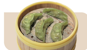
Steamed Vegetable Dumplings 素菜餃 $7.80