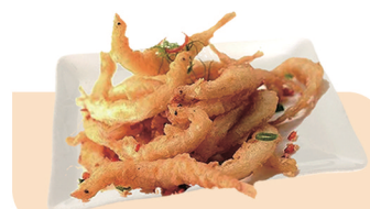
Salt & Pepper Whitebait 椒鹽白飯魚 $18.80