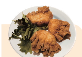
Deep Fried Prawn Dumplings 沙律明蝦角 $10.80