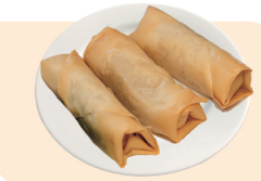
Vegetarian Spring Rolls 炸春卷 $8.80