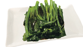
Chinese Green W/ Oyster Sauce 蠔油時菜 $13.80