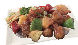
Sweet & Sour Pork 咕嚕肉 $16.80