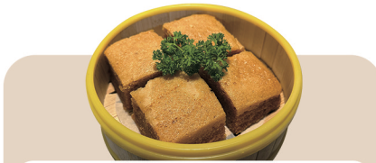
Steamed Cantonese Sponge Cake 圓籠馬拉糕 $7.80