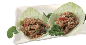
Chicken San Choy Bow 生菜包 $12.80