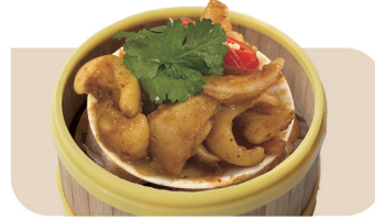
Satay Squid 沙爹魷魚 $17.80