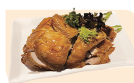
Crispy Skin Chicken 脆皮炸子雞 $18.80