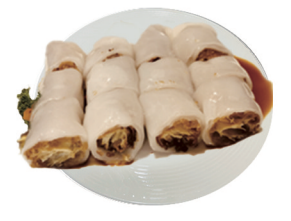
Steamed Rice Noodle Rolls W/ Fried Dough Fritter 炸兩腸粉 $12.80