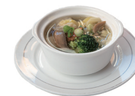
Wonton Soup 雲吞湯 $9.80