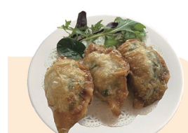
Deep Fried Pork W/ Chives & Garlic Dumplings 炸韭菜角 $9.80