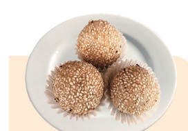
Deep Fried Sweet Sesame Balls 豆沙芝麻球 $7.80