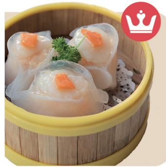
Steamed Scallop & Prawn Dumplings 鳳眼帶子餃 $10.80