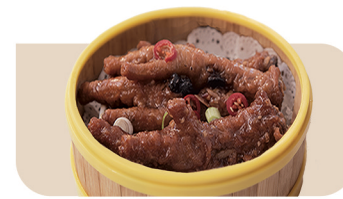
Steamed Chicken Feet W/ Black Bean Sauce 醬汁蒸鳳爪 $8.80