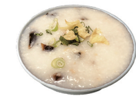
Pork & Century Egg Congee 皮蛋瘦肉粥 $9.80