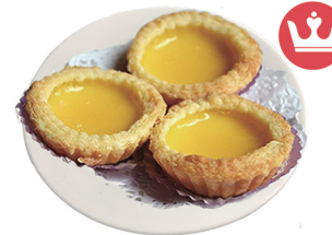
Egg Tarts 千層酥蛋撻 $9.80