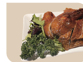
BBQ Duck 燒鴨 $18.80