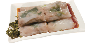
Steamed Beef Mince Rice Noodle Rolls 元茜牛肉腸 $10.80