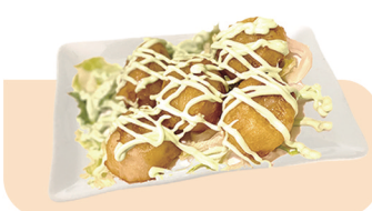
Wasabi Scallops 芥末帶子 $18.80