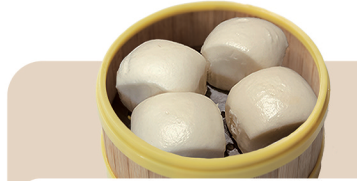
Steamed/ Deep Fried Plain Buns 蒸/炸饅頭 $5.80