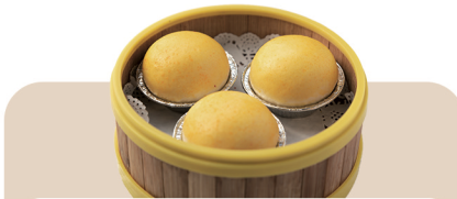
Steamed Salted Egg Yolk Custard Buns 黃金流沙包 $9.80