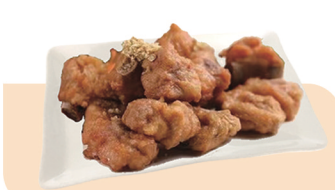
Salt & Pepper Spare Ribs 椒鹽排骨 $17.80