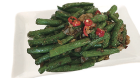
Green Beans W/ Chicken Mince & Chilli Sauce 干煸四季豆 $16.80