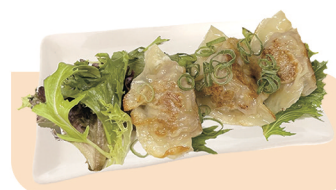
Pan Fried Vege & Pork Dumplings 鮮肉煎鍋貼 $9.80