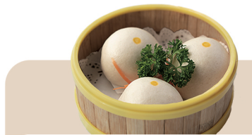
Steamed Custard Buns 香滑奶皇包 $8.80