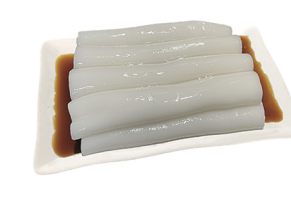
Steamed Plain Rice Noodle Rolls 香滑白腸粉 $9.80