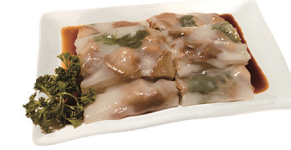
Steamed BBQ Pork Rice Noodle Rolls 蜜汁叉燒腸 $10.80