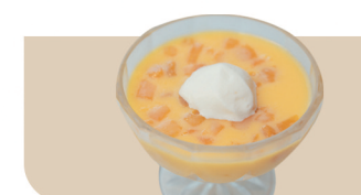
Mango Pudding 芒果布丁 $8.80