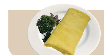
Mango Pancake 芒果班戟 $9.80