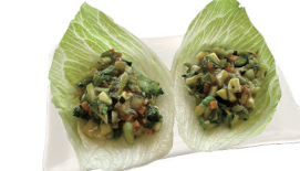
Vegetable San Choy Bow 素生菜包 $12.80