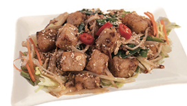
Stir Fried Radish Cake W/ XO Sauce XO醬炒蘿蔔糕 $15.80