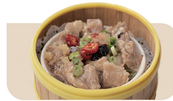
Steamed Spare Ribs W/ Black Bean Sauce 豆豉蒸排骨 $8.80