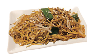
Soy Sauce Fried Noodles 豉油王炒麵 $16.80