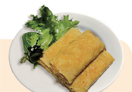
Deep Fried Prawn Beancurd Skin Rolls 鮮蝦腐皮卷 $10.80