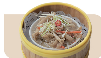
Steamed Beef Tripe W/ Ginger & Spring Onions 薑蔥牛柏葉 $8.80