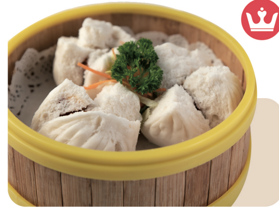
Steamed BBQ Pork Buns 蜜汁叉燒包 $10.80