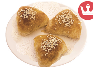
BBQ Pork Pastry 香麻叉燒酥 $9.80