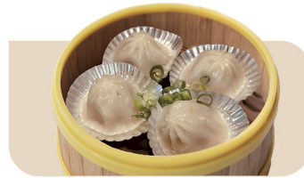
Shanghai Pork Soup Dumplings 上海小籠包 $10.80