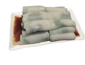
Steamed Coriander Rice Noodle Rolls 元茜蒸腸粉 $9.80