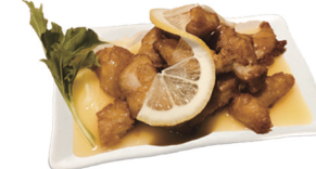
Lemon Chicken 檸檬雞球 $16.80