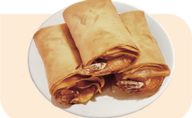
King Prawn Spring Rolls 大蝦炸春卷 $15.80