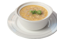
Chicken Sweet Corn Soup 雞肉粟米湯 $9.80