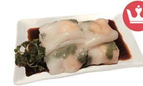
Steamed Prawn Rice Noodle Rolls 原隻鮮蝦腸 $13.80